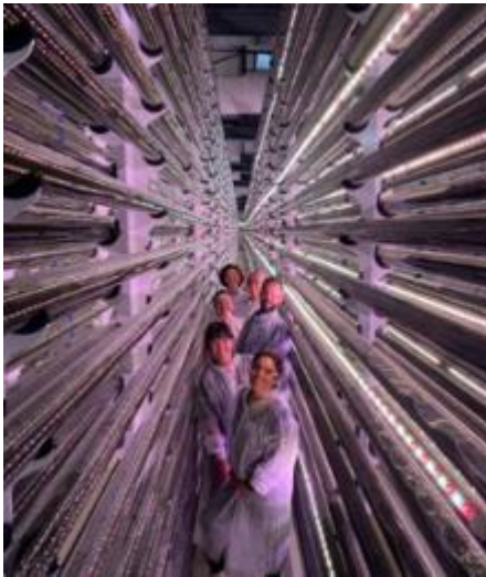
1. Visit to the Microphyt site during the Symposium in September 2024