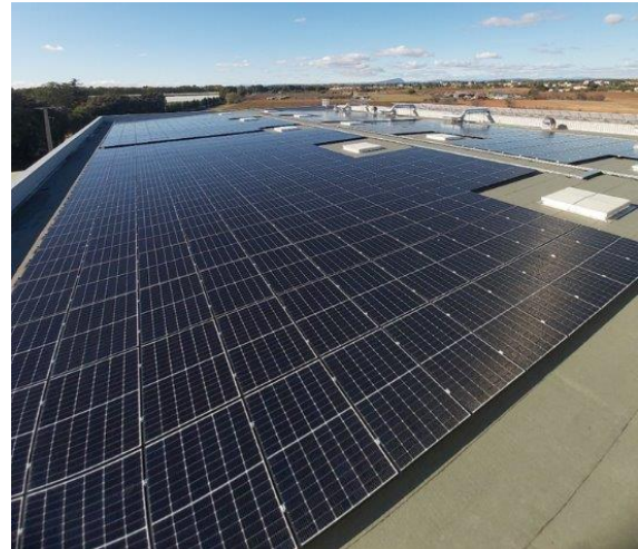
2. Solar panels for self-consumption

The SCALE flagship plant is a cutting-edge facility producing bioactive ingredients from microalgae. Spanning 5,000 m 2 , it features advanced cultivation and processing systems that ensure high-quality, sustainable output. Fully operational since completion, the plant meets FSSC 22000 food safety standards and adheres to the highest cosmetic quality benchmarks, including all cosmetic ingredients being COSMOS approved, guaranteeing both safety and excellence in applications for health and skincare.